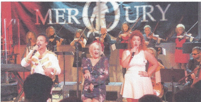
A guest, centre, dances on stage with players from the Berlin Symphony Ensemble and Queen tribute group MerQury at the Culinary and Art Festival at St Anton.