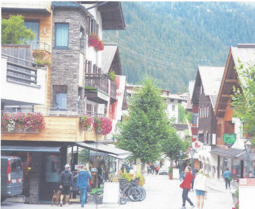
The pretty alpine village of St Anton is better known for its skiing.