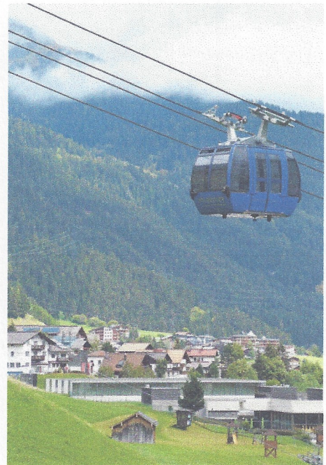
A cable car makes the journey from Galzigbahn cable car station to Valluga, in St Anton.